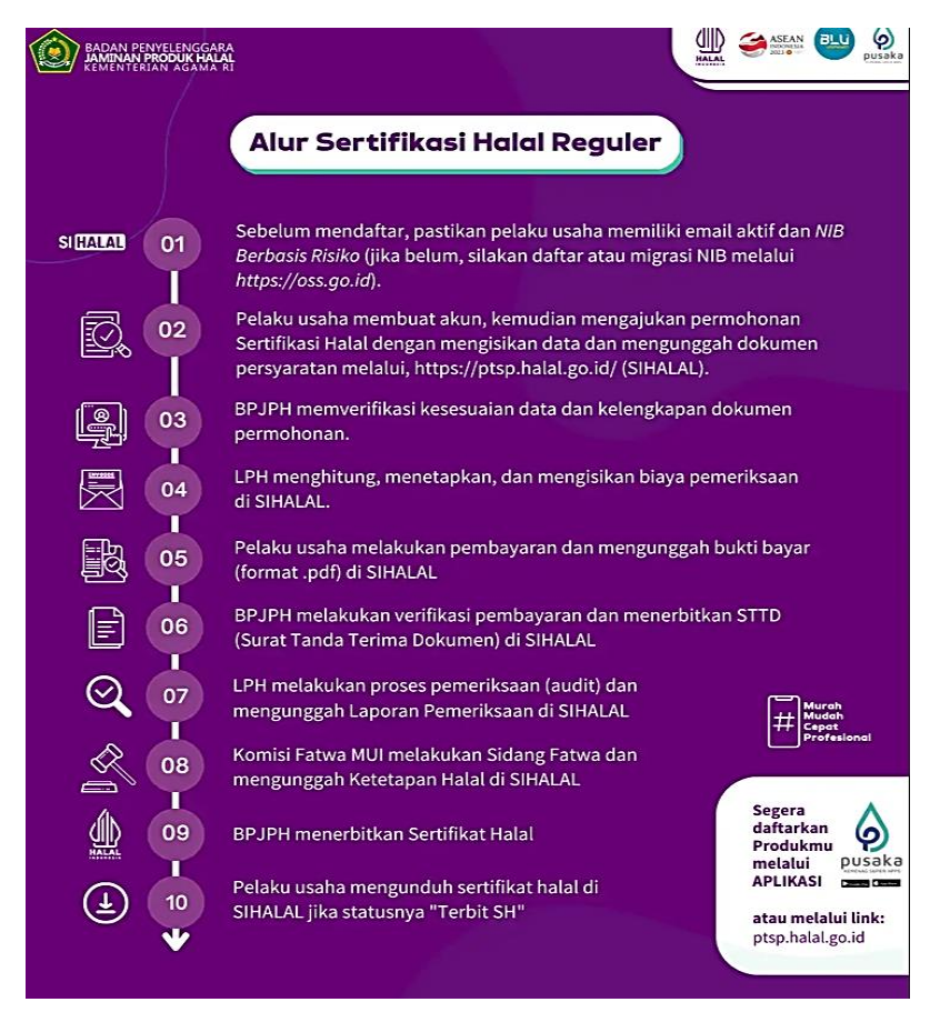
Figure 2. Regular Halal Certification Process Flow

From the flow of the halal certification process above, business actors in applying for halal certification can apply through the website with the page https://ptsp.halal.go.id/ from the flow picture shows that the institution that issues halal certificates is no longer carried out by the Indonesian Ulema Council (MUI) but has become the authority of the Halal Product Guarantee Agency (BPJPH). Requirements in applying for a halal certificate for restaurant businesses are: