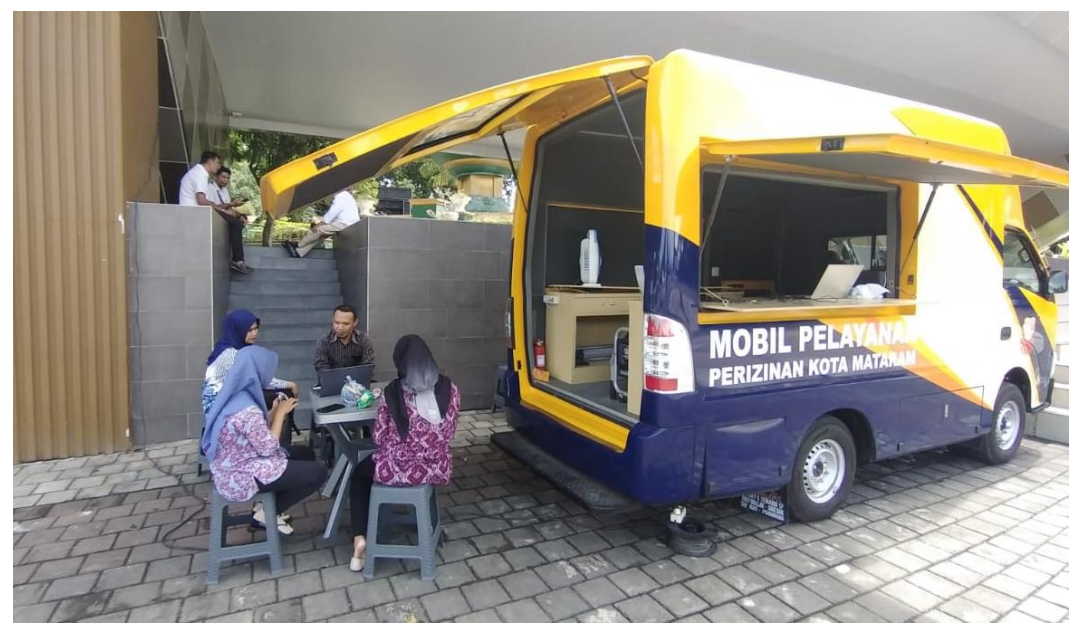
Figure 6. Mataram City Licensing Service Car

According to informant Bahtiar, another effort made by DPMPTSP to socialize OSS and pick up the ball so that the community wants to register their business is by operating an integrated service car which has only been carried out for approximately 4 months which has only started from 2023, the hope is that with this integrated service car more and more people will know OSS and have the desire to register their business licenses. This integrated service car will usually go down to the markets and park in areas that are usually visited by the public, as seen in the following picture: