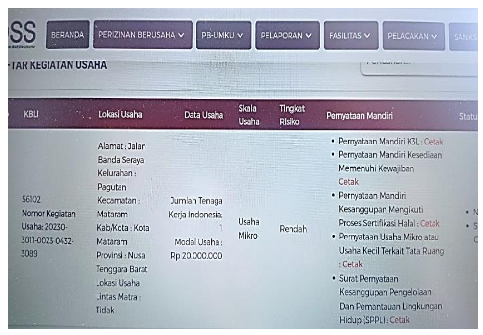
Figure 3: OSS-1 Page (Business License Process)

Business actors can submit directly by opening the website page or can also come directly to the DPMPTSP office in the city of Mataram, and will be guided by the officers there to apply for a business license. Using the KTP, business actors will be registered and will fill in / select the options listed on the page during the registration process. The following is an example of a page contained during the business license registration process if it is in the Low and Medium Low category: