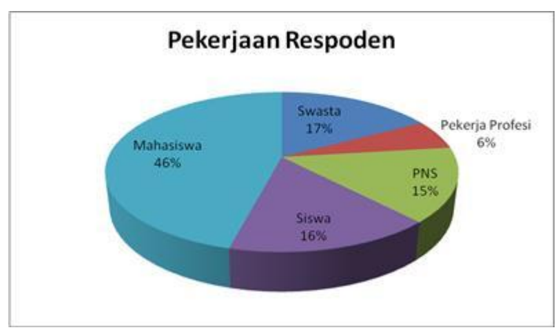
Figure 5: Type of Respondent's Occupation

Figure 5 shows the types of occupations of respondents who have an interest in mountain tourism. It is very clear that, who work as students 46%, private 17%, students 16%, civil servants, 15% and professional workers 6%. The data shows that mountain tourism is preferred by young people who work as students and students, or from young people. Figure 5.6 also shows evidence that some of the activities of young people in the location of Mahawu Mount.