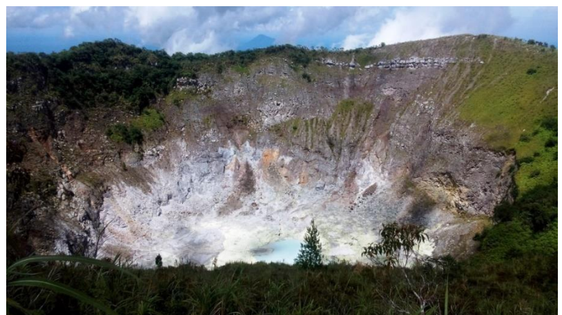
Figure 1. Mount of Mahawu crater that has dried up

Mahawu Mount has a crater depth of 140 meters and has an altitude of 1,311 m above sea level. Geographically, this is a stratovolcano volcano, located in the east of Lokon Mount and Empung Mount volcanoes in North Sulawesi. Access to area tourists will be presented with views of horticultural plantations that are no less beautiful. The green color of vegetables combined with the brown color of fertile soil becomes a combination of stunning beauty. On the slopes of Mahawu, you can find settlements, forests, and also rice fields. In the surrounding area there are many honey birds which are endemic to Sulawesi. The local people do many activities at the foothills of Mahawu Mount, including working as farmers who grow various vegetables up to the middle of the mountain.