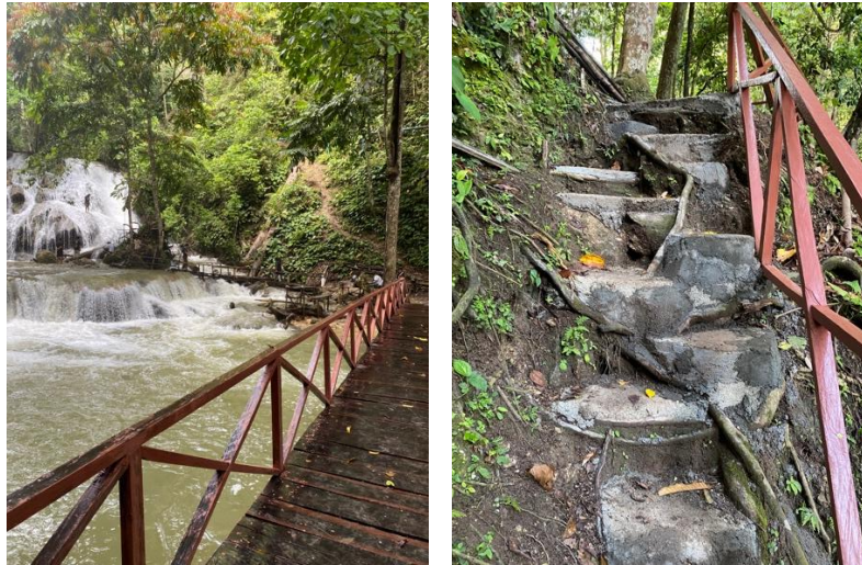
Figure 2. The climbable bridge railings and uneven stair height

the bridge structure that encourages unsafe tourist behaviors, such as climbing or leaning on railings for photos.