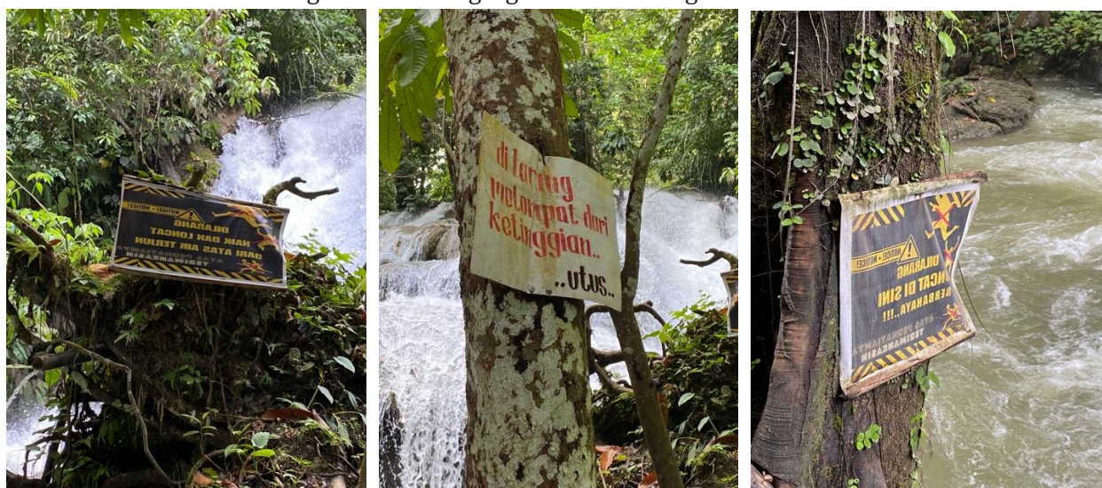
Figure 3. warning signs in several high-risk areas

This finding is in agreement with previous studies on tourism risk management and destination resilience. Previous research indicates that temporarily closure of tourism sites during heavy rainfall or flooding is an effective preventive strategy to reduce tourists' exposure to hazards and is part of administrative and risk elimination controls (Lohmann et al., 2026). Similarly, research on tourism crisis and disaster management has demonstrated that destination closures during environmental disruptions are essential components of preparedness, response, and recovery strategies in risk management frameworks (Liu et al., 2024). It is clear that studies on tourism safety policy and sustainable public management reveal that infrastructure improvements, including safe pathways, stronger bridges, and improved visitor amenities, significantly reduce accident risks and strengthen tourists' sense of safety (Dewi et al., 2025; Lohmann et al., 2026). Hence, the research findings clearly validate the existence of evidence that proactive closure strategy is a key element in the safety risk management process within nature-based tourism destinations.