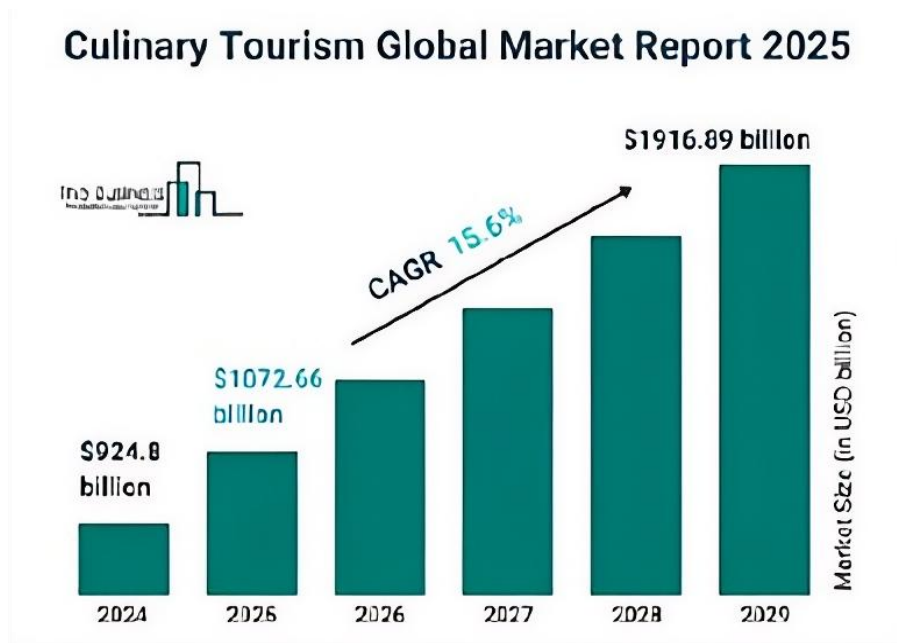
Figure 1. Culinary Tourism Global Market Report 2025

Globally, gastronomic tourism has experienced significant growth, with the culinary tourism market projected to increase from USD 924.8 billion in 2024 to USD 1,072.66 billion in 2025 (The Business Research Company, 2025). This growth reflects the increasing demand for authentic and culturally embedded food experiences and highlights the growing role of gastronomy as a strategic asset for destination development, cultural heritage preservation, and local economic growth (Nesterchuk et al., 2021; Lin et al., 2021; Virto et al., 2024). However, while expanding tourism markets create opportunities for communities to preserve and promote traditional culinary heritage through community-based gastronomy tourism, they also increase the risk of commodification and standardization of local foods to satisfy tourist expectations, potentially undermining their authenticity (Cohen & Avieli, 2004; Oie & Takada, 2024; International Journal of Gastronomy and Food Science, 2024). This tension between tourism development and cultural preservation highlights the importance of examining how authenticity is maintained and perceived in community-based gastronomy tourism, particularly for traditional foods such as Ebatan that embody local cultural heritage, indigenous knowledge, and community identity.