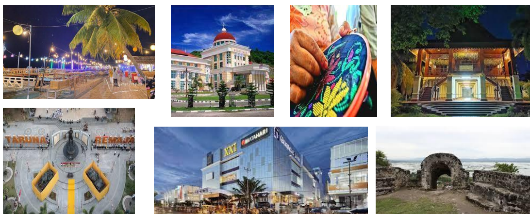
Figure 1. Urban Tourism Potential in Gorontalo City

Gorontalo City is the capital city of Gorontalo Province, with an area of 79.59 km 2 , or 0.71% of Gorontalo Province. As the capital of the province, this city has various tourism potentials that can be developed as urban tourism. The tourism potentials are the governor's office, old town area, historical monument of Gorontalo Nani Wartabone national hero, Gorontalo culinary and culinary center, campus, Gorontalo State University, Gorontalo Mall or shopping center, Gorontalo central traditional market, city park, Taruna Remaja field, Dulohupa traditional house, Popa Eyato Museum, Tamendao beach, Mufidah souvenir, Kerawang shop, Baiturrahim Mosque and Hunto Mosque (Sultan Amai), Lahilote Swimming Pool and Sport Center, and Ot.