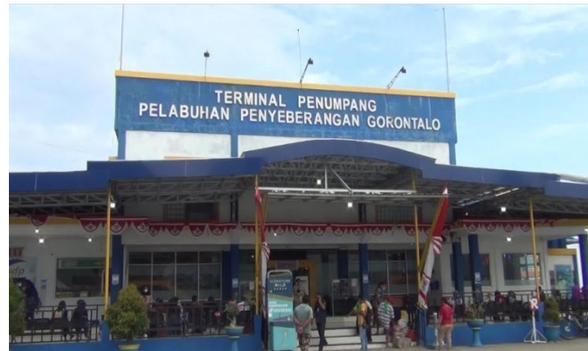
Figure 2. Supporting Components of Urban Tourism in Gorontalo City