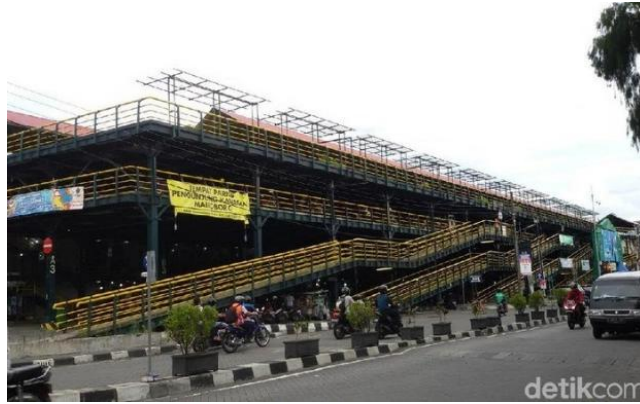
Figure 3. Abu Bakar Ali Parking Lot

Meanwhile, the parking area for Malioboro, Beskalan and Beringharjo Malls are still more affordable based on distance. However, these three parking areas have a more limited capacity and 2 of them are not equipped with parking standards for persons with disabilities who require more space to get off/up to the car. Meanwhile, the Beskalan parking lot has been equipped with special parking space facilities for persons with disabilities in one corner of the car park entrance. This special room is also under the supervision of officers so that it is not used by general users.