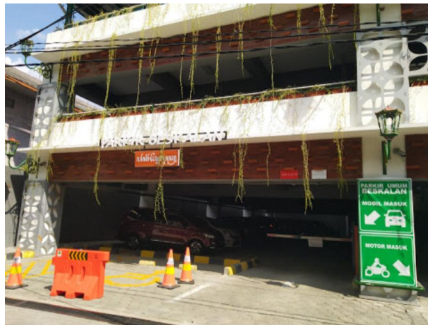
Gambar 4. Beskalan Parking Lot – Parking Area for Persons with Disabilities

Meanwhile, the parking area for Malioboro, Beskalan and Beringharjo Malls are still more affordable based on distance. However, these three parking areas have a more limited capacity and 2 of them are not equipped with parking standards for persons with disabilities who require more space to get off/up to the car. Meanwhile, the Beskalan parking lot has been equipped with special parking space facilities for persons with disabilities in one corner of the car park entrance. This special room is also under the supervision of officers so that it is not used by general users.