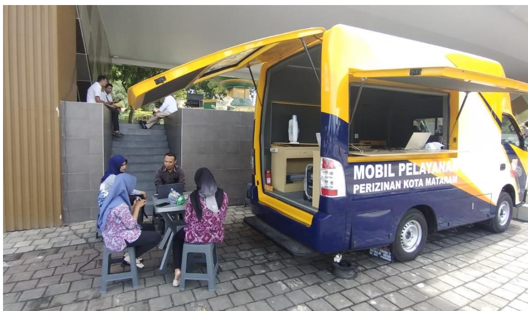
Figure 6. Mataram City Licensing Service Car

According to informant Bahtiar, another effort made by DPMPTSP to socialize OSS and pick up the ball so that the community wants to register their business is by operating an integrated service car which has only been carried out for approximately 4 months which has only started from 2023, the hope is that with this integrated service car more and more people will know OSS and have the desire to register their business licenses. This integrated service car will usually go down to the markets and park in areas that are usually visited by the public, as seen in the following picture: