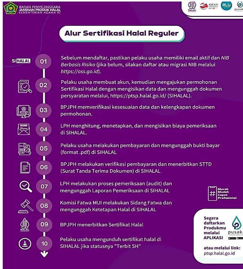
Figure2. Regular Halal Certification Process Flow

From the flow of the halal certification process above, business actors in applying for halal certification can apply through the website with the page https://ptsp.halal.go.id/ from the flow picture shows that the institution that issues halal certificates is no longer carried out by the Indonesian Ulema Council (MUI) but has become the authority of the Halal Product Guarantee Agency (BPJPH). Requirements in applying for a halal certificate for restaurant businesses are: